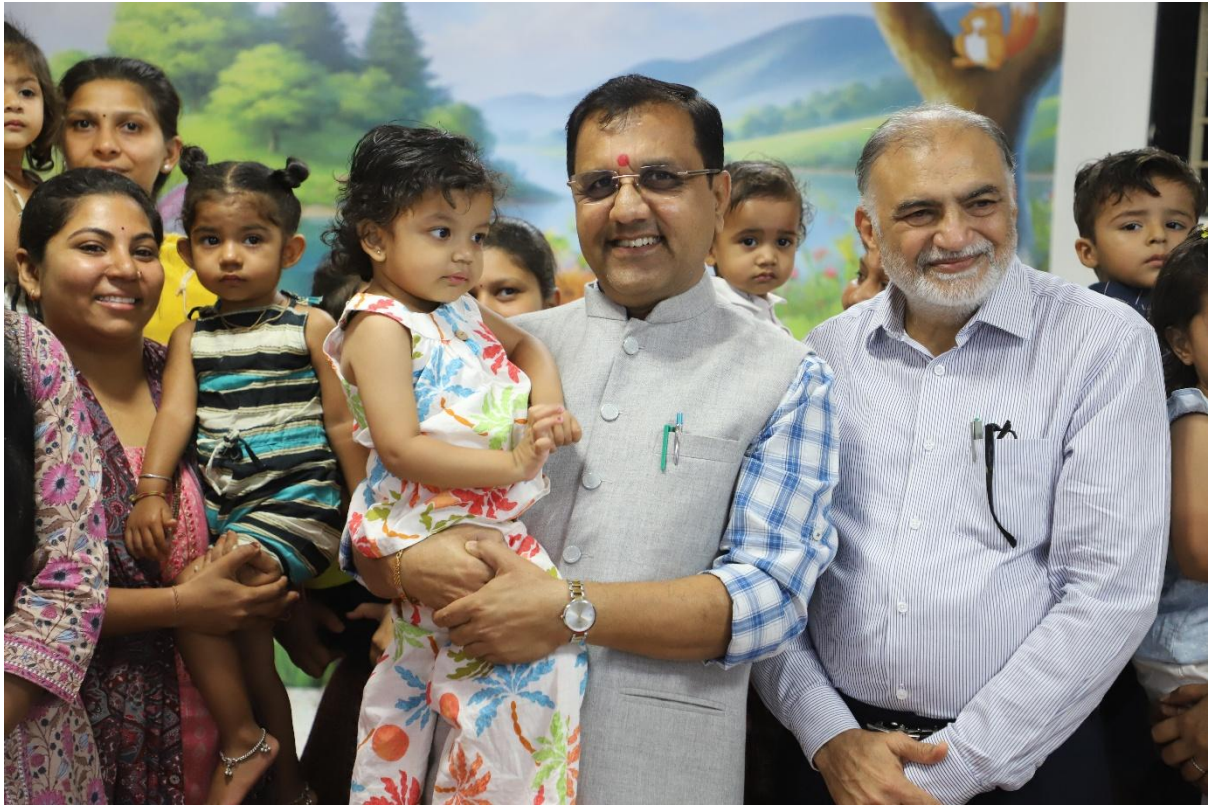
Tapovan Visit – Honorable Education Minister Dr.Pradyumna Vanja