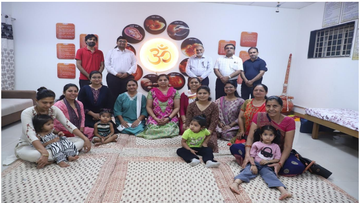
Tapovan centre opening , Sector-29